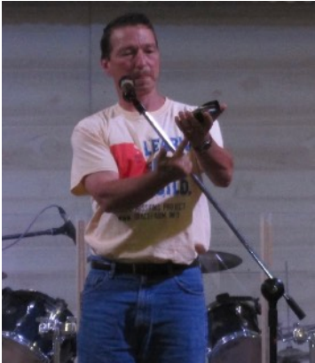
Doing the Wallet Thing.