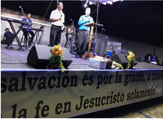
Central America Crusade