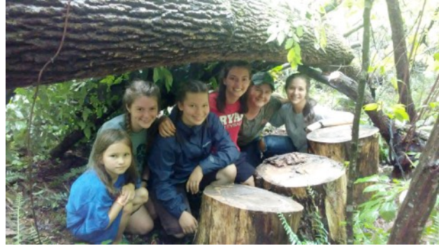
Cope, survive, and execute the mission.