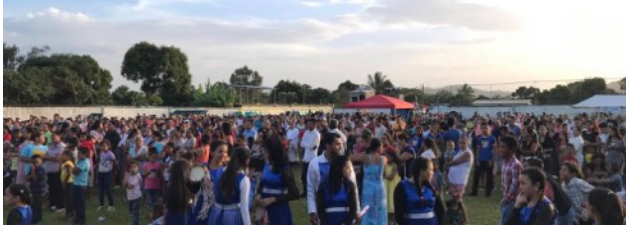
Wahoo! Gospel time!