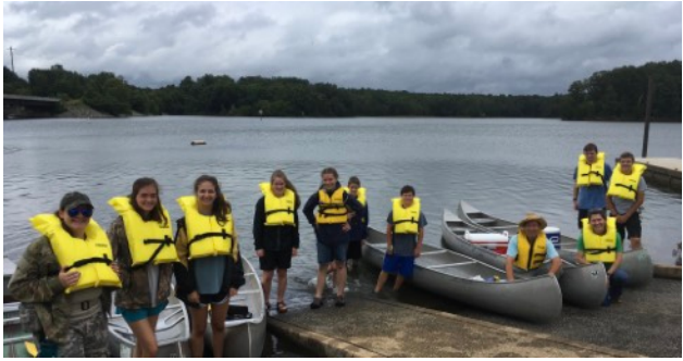
Canoe launch at Wild Camp!