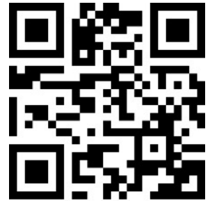
Focus On the Bible Podcast