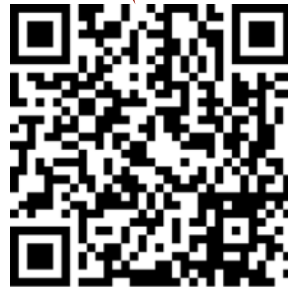
Freddie Coile Youtube Channel