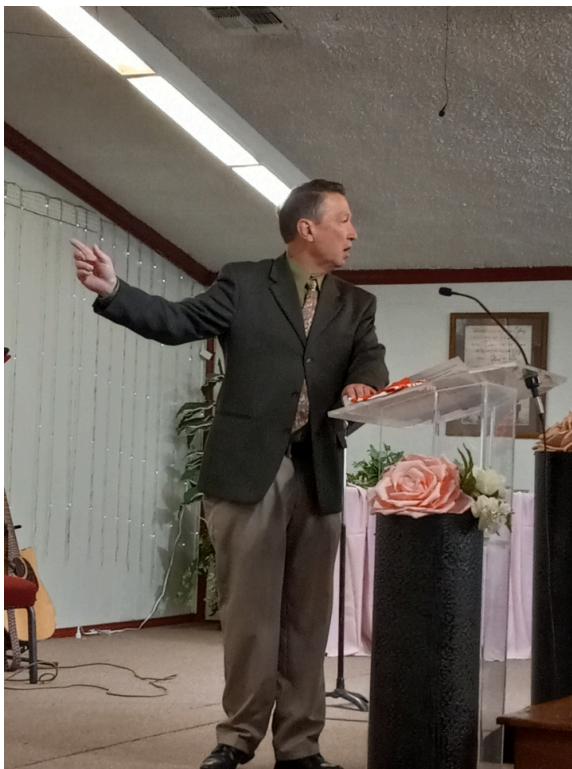
Grace Community Church, Pharr, TX.